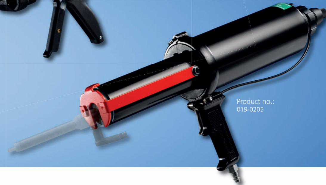
Product no.: 019-0205