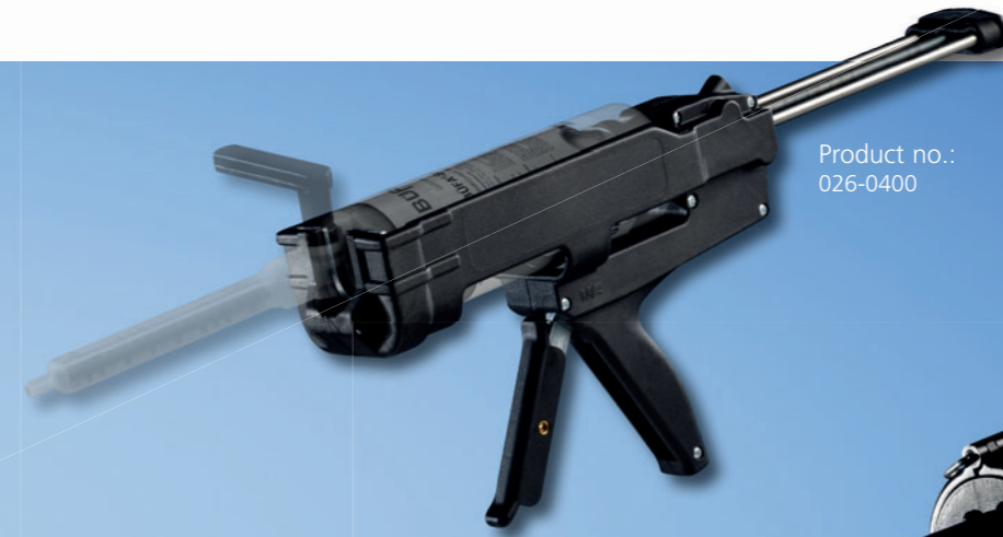
Product no.: 026-0400