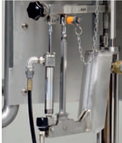
Peroxide pump with spindle adjustment