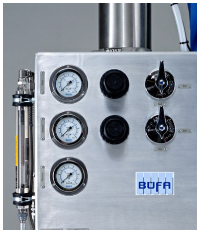
Operating panel with flow control