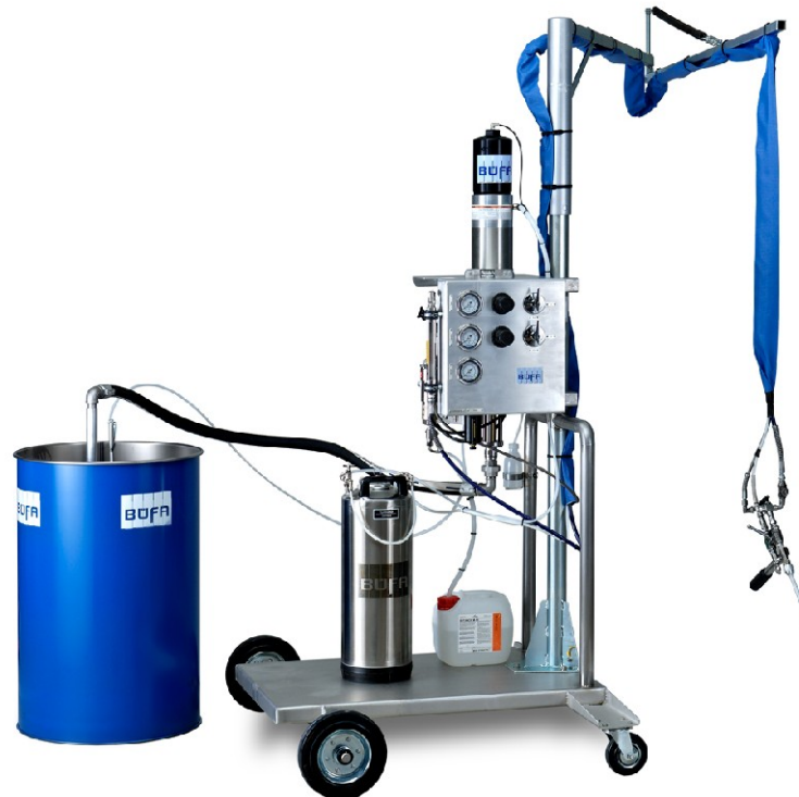
Air motor and mixing head is different from illustration